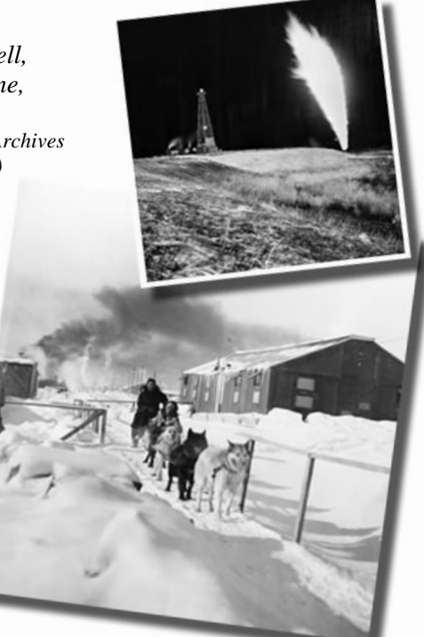
Dog team and prefabricated hut, Norman Wells, NWT 1944

Okalta well, night scene, 1930s