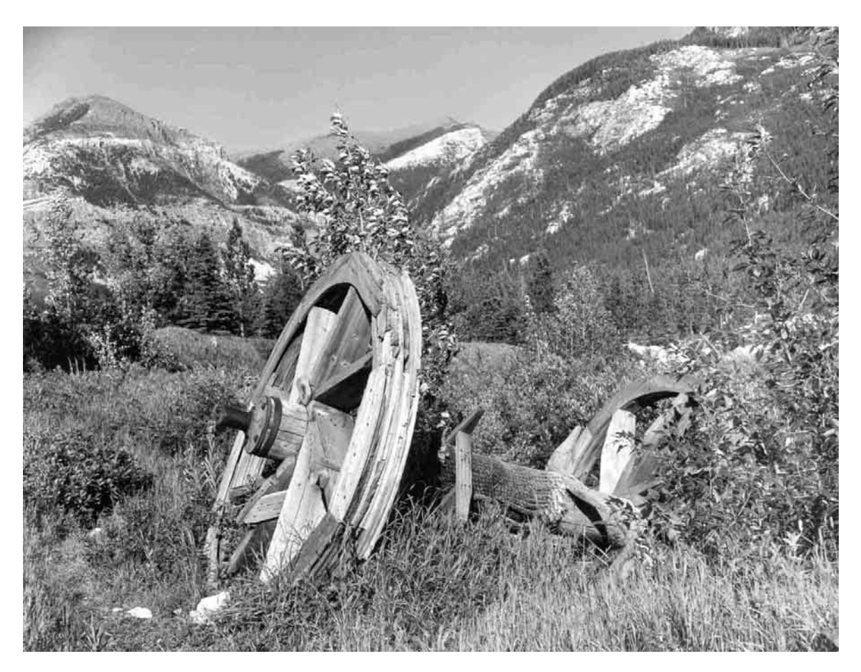
Bull Wheel of Rig at "Oil City" Waterton Park – Equipment circa 1901, photo circa 1955.