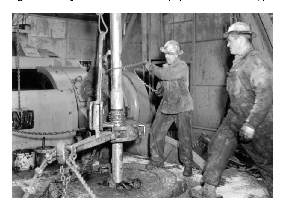
Drillers at work throwing the chain to make a connection, Western Canada circa 1960.