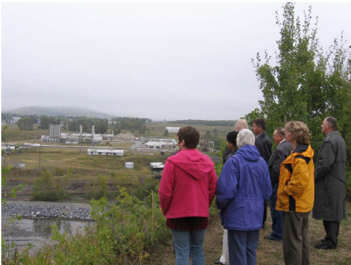
Turner Valley Panel members view the Gas Plant site from the south side of the Sheep River (Photo courtesy of David Finch).

Thanks to David for his report and analysis.