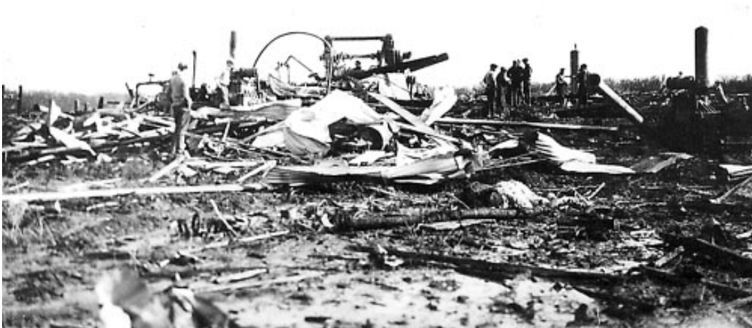
The wreckage at Royalite #23 in 1931. Photo NA-2570-18 courtesy of Glenbow Archives.