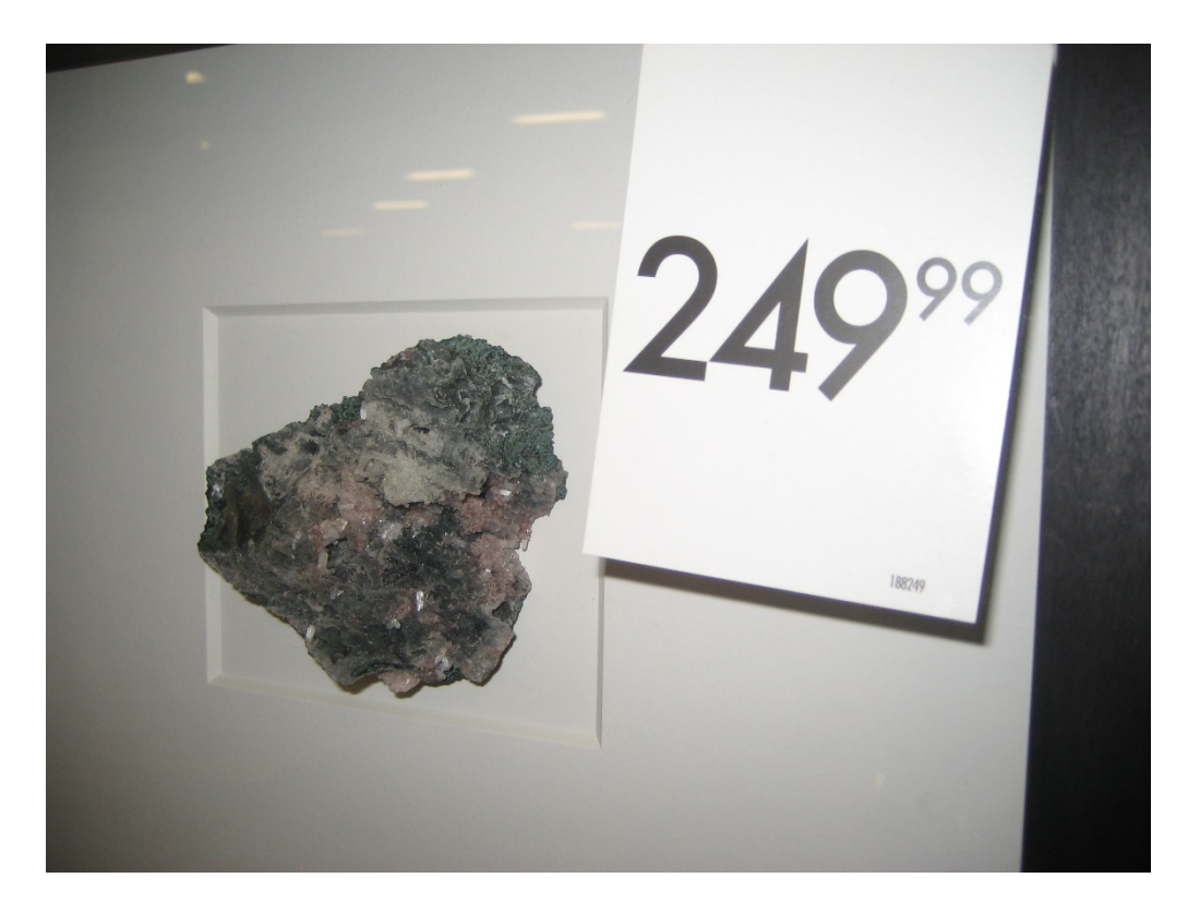
Been wondering what you can do with your old rock collection? As recently spotted at Homesense, just glue them into a frame and put an outrageous price on them. Your spouse will be so happy!