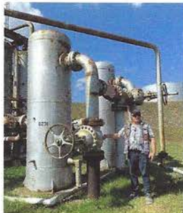
Piping at TVGP