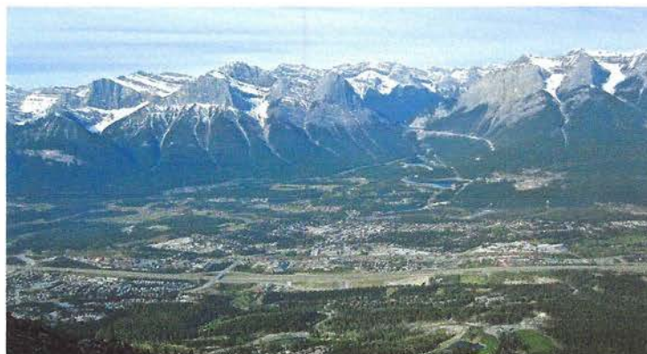
Canmore in the Mountains

Most non-local attendees will fly into Calgary International Airport (YYC). Rental vehicles can be reserved for the drive to Canmore or, alternatively, bus transportation can be accessed via Banff Airporter (ten shuttles daily between Canmore and YYC).