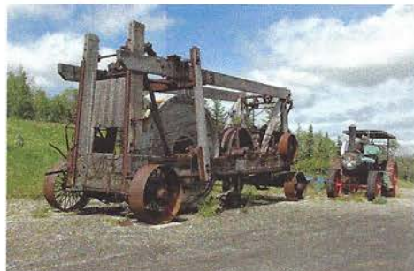
Rig at Canadian Museum of Making

The Turner Valley Field was the main focus for Western Canada's petroleum industry up until the discovery of oil at Leduc, near Edmonton, in 1947. Major discoveries were made in its vicinity in 1914 (shallow Cretaceous), 1924 (deep Mississippian natural gas) and 1936 (deeper Mississippian crude oil). The field is still active although at a much lower level of production than at its peak that occurred during World War II. The main remnant of this early heritage is the Turner Valley Gas Plant that is now owned by the Alberta Culture branch of the Province of Alberta. It is both a provincial and a national historic site. Tours are run during the kinder weather months – and we will be going on one as a part of our field trip.